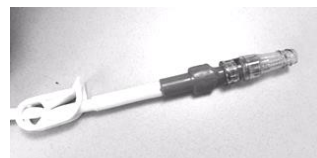
Valved IV catheter cap